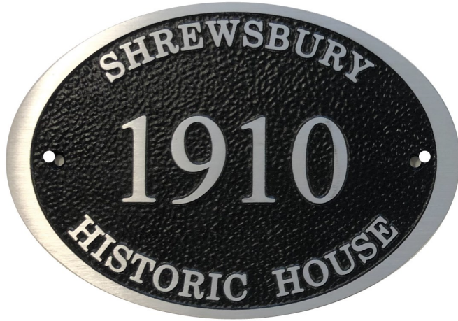
STYLE 1 (Example photo)